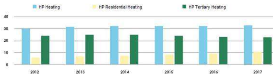
Figure 1. Residential and Tertiary HPs Heating

Based on the available data in 2017, it is estimated that 900,000 homes use heat pumps as their main heating system with an average capacity of 10 kW, an overall stock of approximately 9 GW is estimated. On the other hand, a stock of heat pumps of 24 GW is estimated to be used as the main heating system in the buildings of the tertiary sector 18 .